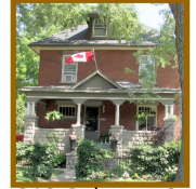
312 Cobourg St.