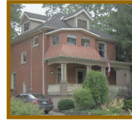
171 Ballantyne Ave.